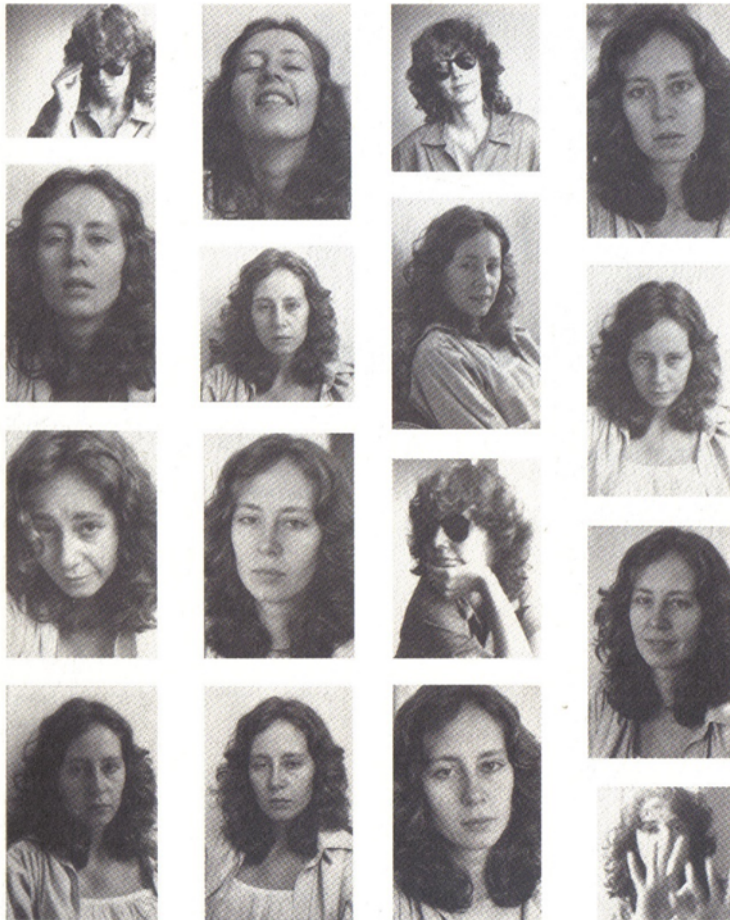
Fig. 1. Collage of pictures of Ana Cristina Cesar [1].